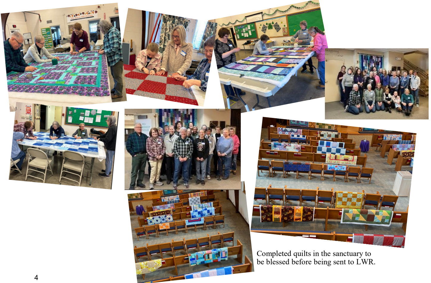
Completed quilts in the sanctuary to be blessed before being sent to LWR.

We would like to finish a few more quilts in the next few months so if you want to help assemble quilts, please join us at one of our regular quilting Saturdays from 9:30am to Noon — April 5 and May 17. (Note the changes in our regular two meeting a month schedule.)