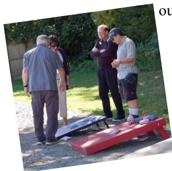
Fun, Food & Fellowship at our Welcome Back Cookout on September 8th