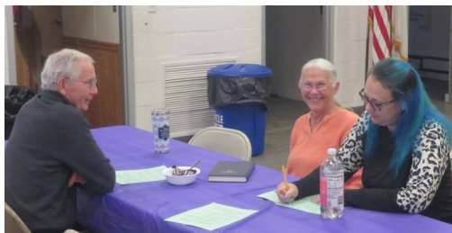
September 22nd Cross Generational Event

Many thanks to the participants in our initial Fall 9 to 10 AM Cross Generational Event. We enjoyed some learning and fun as each group explored the upcoming Gospel lessons and learned a bit more about each group member. Our next Cross Generational Event will be held on Sunday, October 20th at 9 AM. This will involve Crafts, Learning and Fun. Please consider joining and helping us to build this ministry.